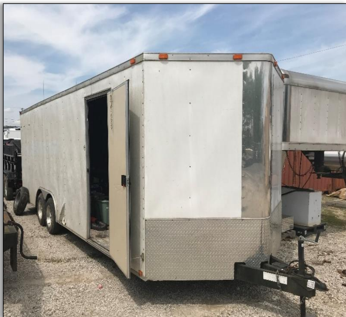
Recovered CTE King America trailer