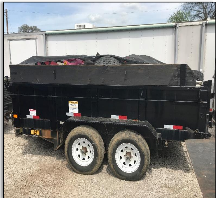
Recovered CTE Big Tex trailer