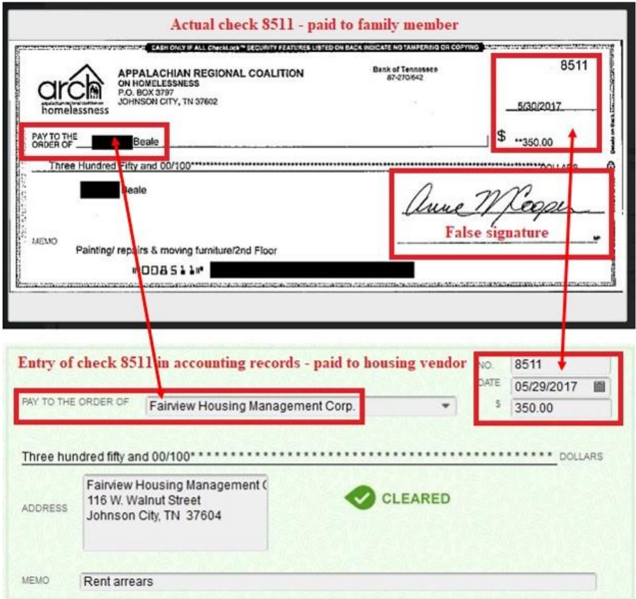
False entry made in ARCH accounting records to conceal check paid to Beale family member.