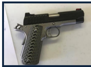
The chief’s town-issued weapons – CZ Scorpion and Kimber – that he purchased for $1.00