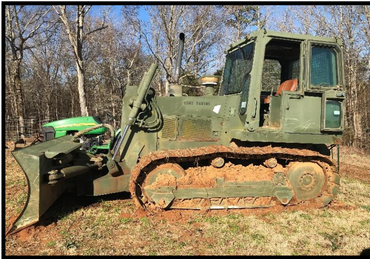
The Case bulldozer originally owned by the town that was sold to the former Hardeman County mayor.

Investigators requested documentation from the auction for the bid history on the bulldozer to confirm who was the second highest bidder; however, no such documentation was presented. According to the auction, the only documents they have related to the sale are bank statements and an auction settlement sheet that details the original buyer's cost, commission fee, and sales tax charged. Due to a lack of documentation of bid history, there is no evidence to support the former mayor being the second highest bidder of the bulldozer, and therefore investigators question if the bulldozer was sold through proper bidding procedures at the highest possible price.