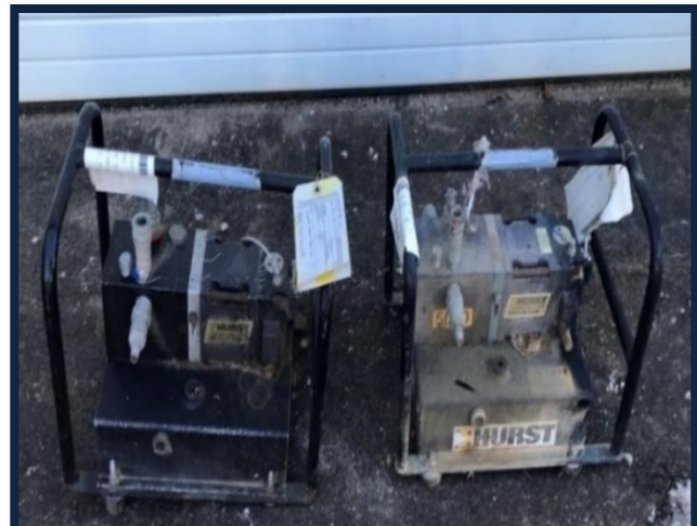
The pumps the former employee returned to town officials one day prior to meeting with investigators.

The former employee told investigators that around 2018-2019, he stored two hydro-hurst pumps at his residence due to a lack of storage space at the police department, and that he never used the equipment because they were missing certain components needed to operate properly. The chief told investigators that due to his lack of oversight, he did not know how the pumps ended up at the former employee's house, or that the pumps could have ended up there by accident. On November 4, 2021, one day prior to meeting with investigators, the former employee returned the pumps to town officials ( Refer to Exhibit 4 ).