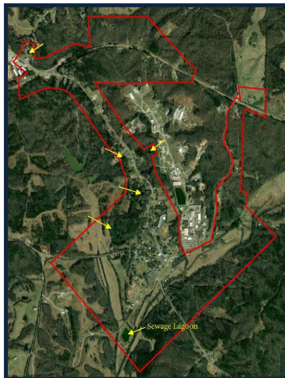
The yellow arrows denoting the locations of five ponds within boundaries of the town, shown in red line.

Exhibit 6 is a map of the Town of Toone's town limits. The yellow arrows denote the bodies of water within town limits. There are five ponds on private properties – four of the ponds average less than half an acre each, the fifth pond is approximately two acres, and the town owns and maintains a sewage lagoon. Due to the relatively small number of bodies of water in the town, investigators question the town's ability to put all 10 boats to use, and therefore cannot confirm that the town was meeting the program's requirements.