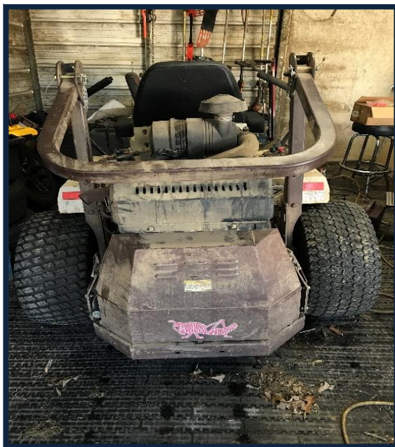
The lawnmower investigators verified in the alderman's garage.

premises and use it to mow the town's grass after he finished repairing it. The alderman stated the lawnmower had been stored at his personal premises since fall 2020 (about a year total), and he kept it because no one had asked him to bring it back. The chief told investigators that he allowed the alderman to take custody of the lawnmower, repair it, and use it to mow the town's grass, not for personal use. However, investigators question the chief's statement since he knew the lawnmower was in need of repairs, and the alderman used his own money to repair it without ever being reimbursed by the town.