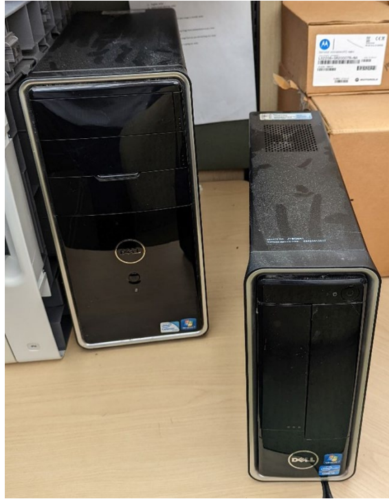
Photo of two computers belonging to the former systems administrator found in an unused cubicle within the Upper Cumberland Regional Office of the Department of Health

The computer towers did not have state-assigned asset tags, and the Office’s inventory listing showed that the Office did not own any Dell products at the time the computer towers were located. Additionally, investigators located a document on the systems administrator’s work-assigned laptop on which she listed “work on getting home PC fixed” as a to-do list item.