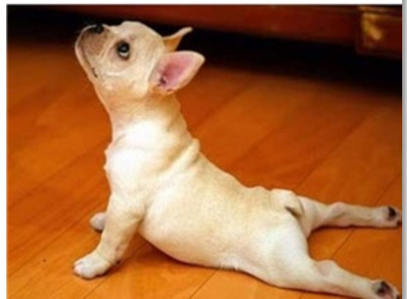
Images found on the former systems administrator's work-assigned devices