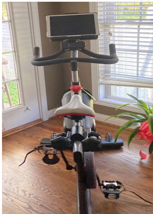
Photo of the former systems administrator's work-assigned tablet as discovered by investigators during the seizure of work-assigned devices

Failure to comply with the State of Tennessee Acceptable Use Policy increases the risk of compromising the security of confidential information or documentation obtained from, or pertaining to, the State's computer systems. State employees should always take appropriate measures to safeguard and protect the information and computer resources of the State from inadvertent or intentional risks of exposure.