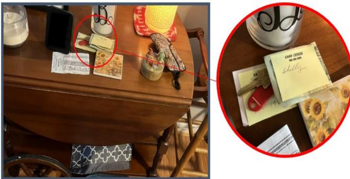
Funds placed on a table located in the secretary’s kitchen, not in a cash drawer or vault

The town hall is only used to hold monthly meetings for both the board and Liberty Fire Department (fire department). Occasionally, the town hall’s kitchen is rented out to town residents or used to cook community meals.