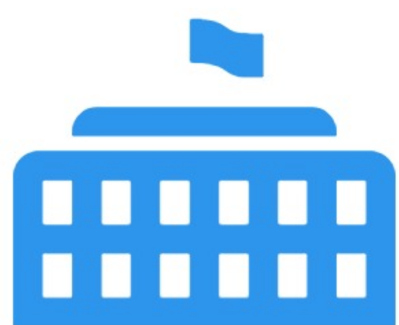
Counted: District BEP