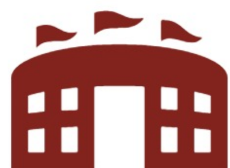
Attending: Non-public school options such as home or private schools