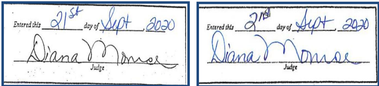
Photocopied signature (Left) compared to a legitimate signature (Right) of Diana Monroe, Clay County General Sessions Judge.

The example on the above left of a photocopied signature also reveals an area surrounding the signature line containing small black specks, which occurs when pieces of dirt or dust are present on the glass of the photocopier.