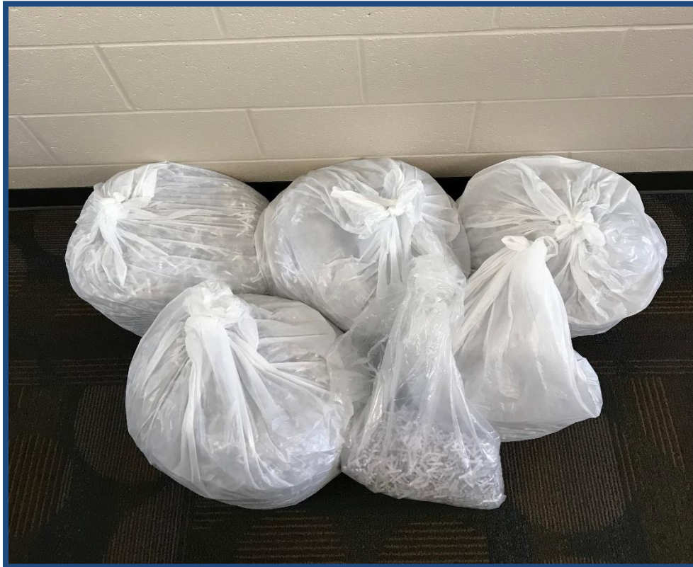
Plastic bags containing expungement orders shredded by Birdwell shortly following an interview with investigators.