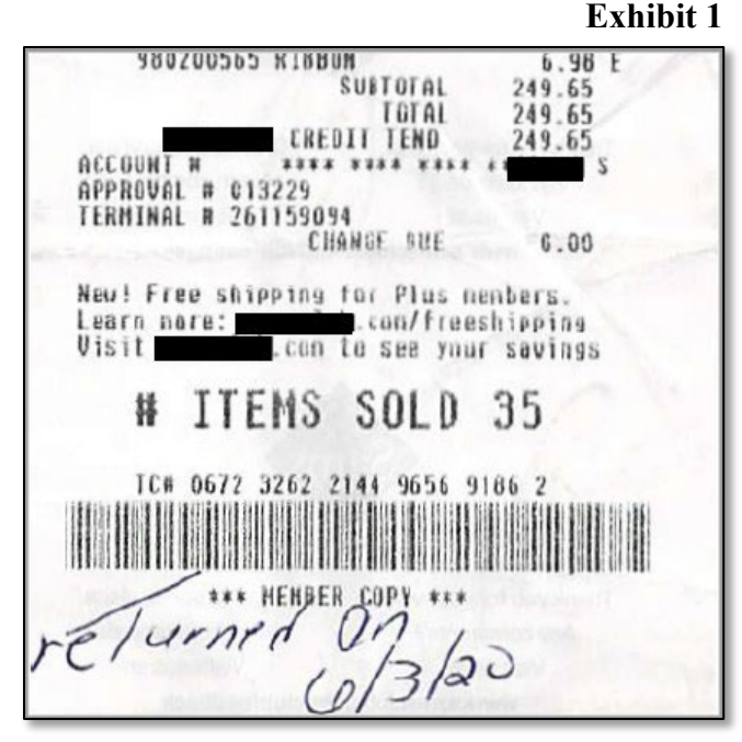
Excerpt of receipt for purchase made on November 13, 2019, including a note made by the bookkeeper listing the date the receipt was remitted by the principal.

A. The principal failed to follow purchasing procedures and did not properly complete and/or timely remit supporting documentation to the bookkeeper for some disbursements. Lawrence County Board of Education Policy 2.808 states "All purchases made by the school system shall be by purchase order or formal contract, and no purchase shall be made, nor payment approved unless covered by an approved purchase order." The principal failed to properly prepare and/or remit purchase orders and receipts to the bookkeeper immediately after the purchases were made. Investigators reviewed a sample of 24 purchases and noted ten instances where purchase orders were not issued, five purchases had missing receipts, and eight purchases' supporting documentation was not remitted to the bookkeeper timely. For example, the principal made a purchase of $249.65 on November 13, 2019, but did not remit the supporting documentation to the bookkeeper until June 3, 2020 (See Exhibit 1).