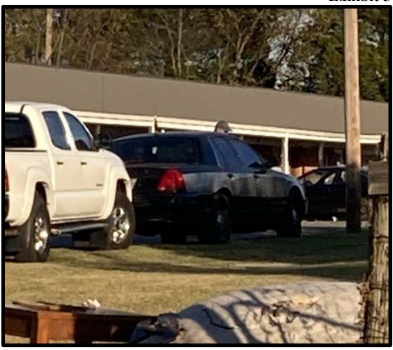
October 26, 2023: MHEMA assigned, county-owned, Ford Crown Victoria car driven by the director at the private apartment complex (he obtained an ownership interest on December 28, 2023).