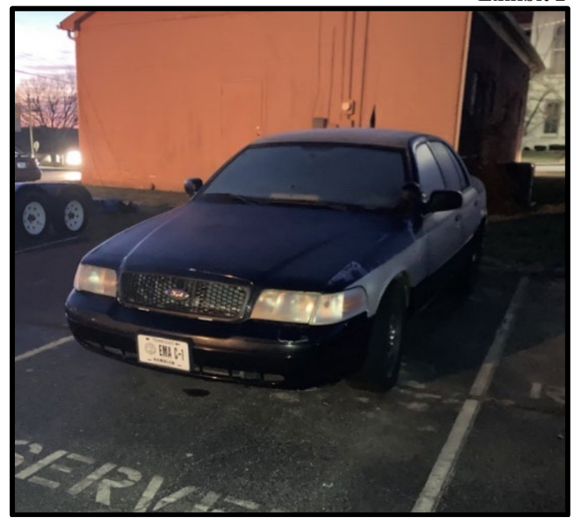
County-owned Ford Crown Victoria car assigned to MHEMA.