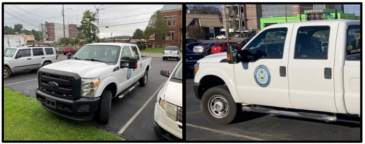
County-owned Ford F-250 truck assigned to MHEMA.