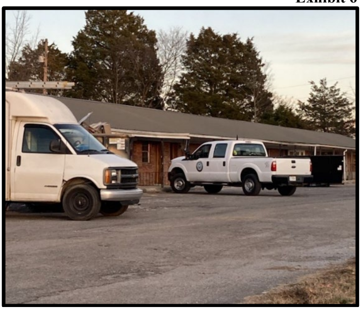
February 8, 2024: MHEMA assigned, county-owned, Ford F-250 truck at the private apartment complex, where it appeared construction work was being performed.