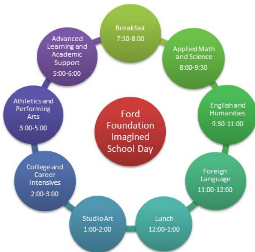
Exhibit 1: Potential Extended Learning Time Schedule